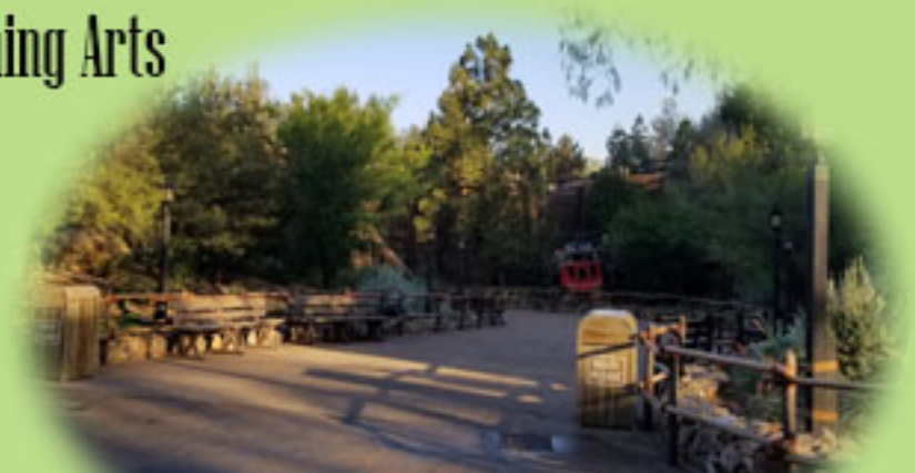
The Stagecoach Meet Location