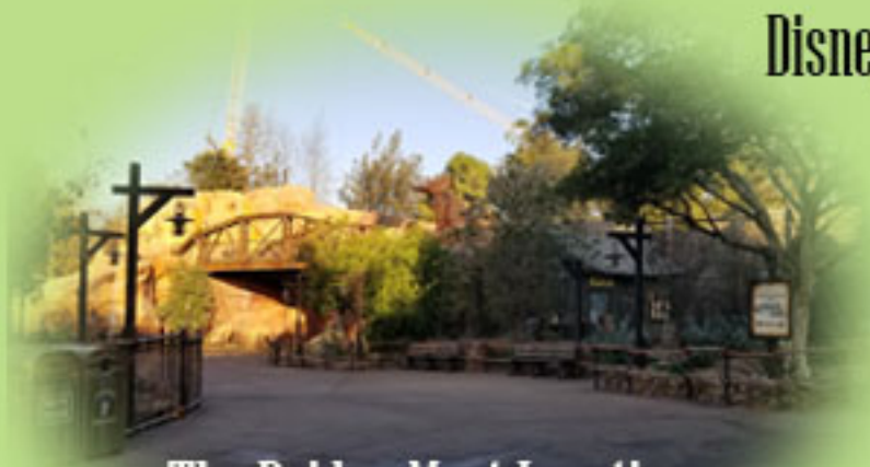
The Bridge Meet Location